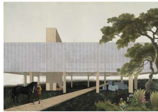
Kopčany field roof

Going back from the present to the past and vice versa in the Czech-Slovak border area in Kopčany